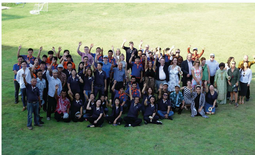
Different cultures and nationalities work together at Paul & Co Asia to provide customers with what they need.

The Kunert family of entrepreneurs had already come to recognise – through its cooperation with the Beillards in France and the family-led Nippon Paper Core company in Japan – that family companies especially value and appreciate the human touch.