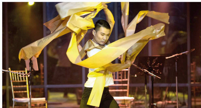
Artists and performers made the inauguration celebration unforgettable.

This means that customers can rely on long-term relations with well-known contact persons and experienced sales partners, allowing them to build up a unique measure of trust. Technology and expertise interlock perfectly with research and development, thus enabling the company to fulfil every need of customers in Asia as well as to enter new markets.