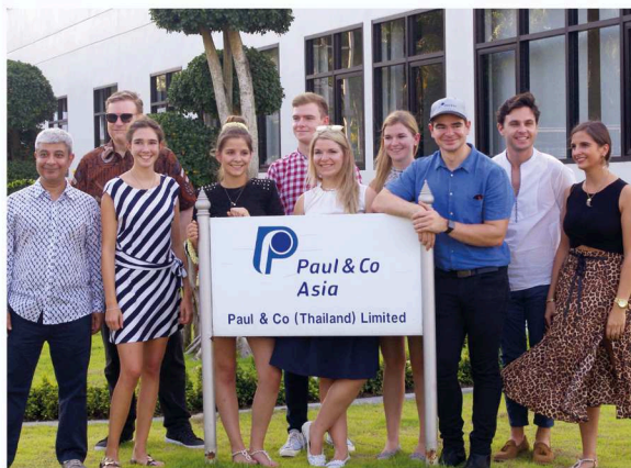
The next generation of Kunerts and Sachdevs is good-humoured and already integrated into the company.

Thus the next generation is already included in every decision-making process, and the youngest generation of Kunerts is beginning to take on its first tasks in the company. They are all united by having completely internalised communal cooperation as a way of life, as a way of growing together.